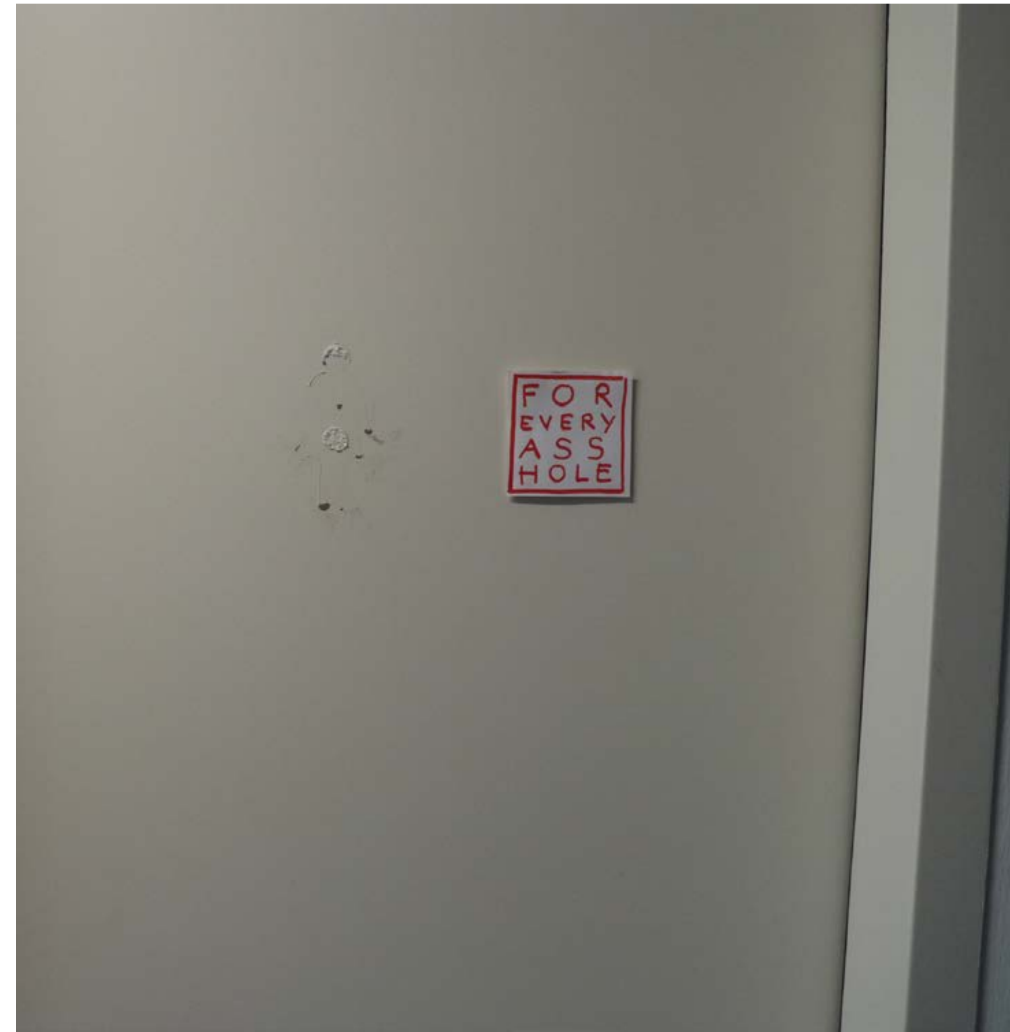
view of an experiment of new genderless sign for the bathroom