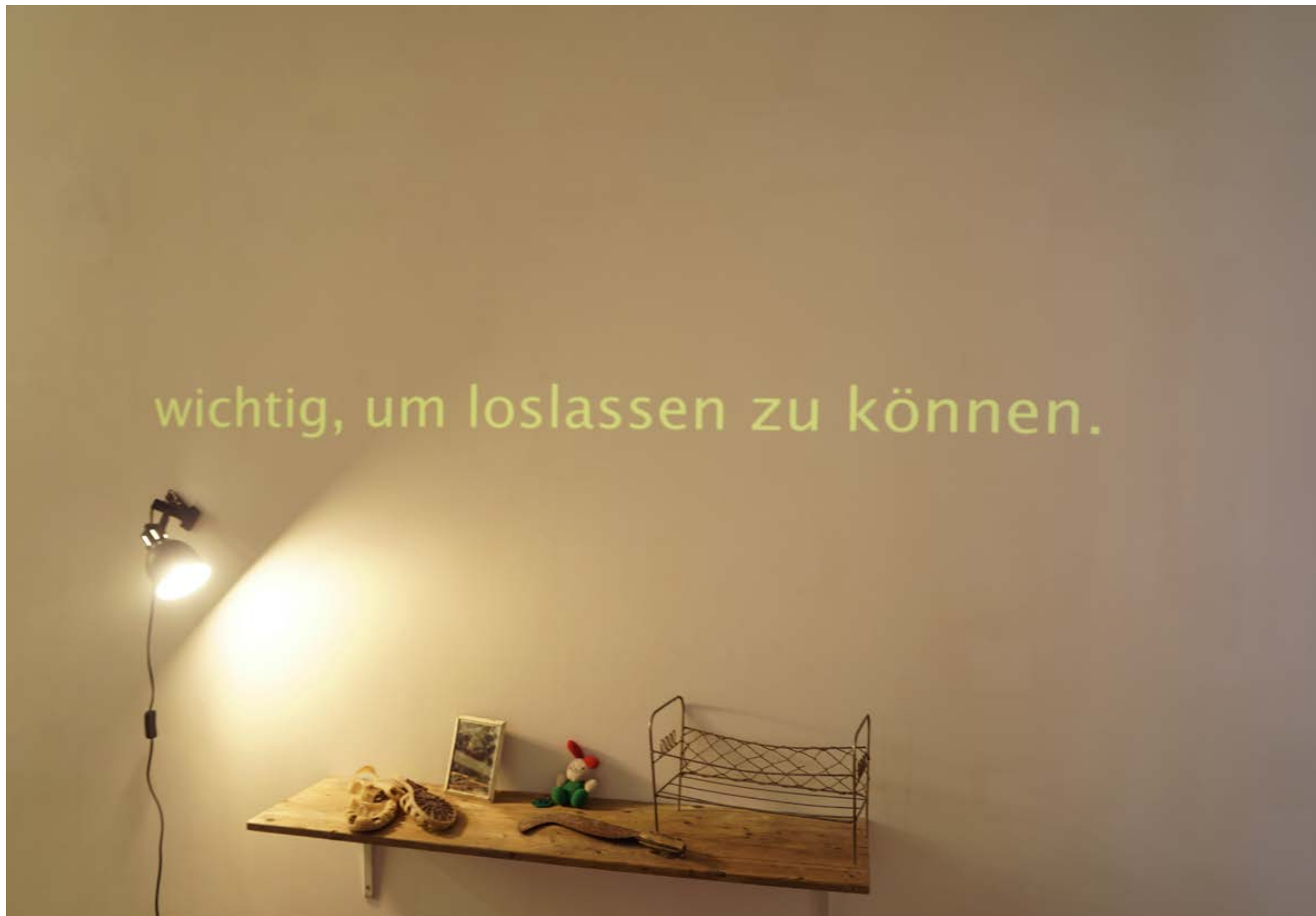
photos: view of exhibition at all inclusive festival, with subtitles