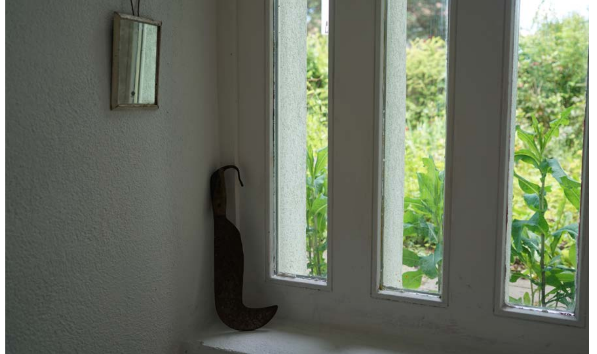
photos: view of exhibition at océan et ciel