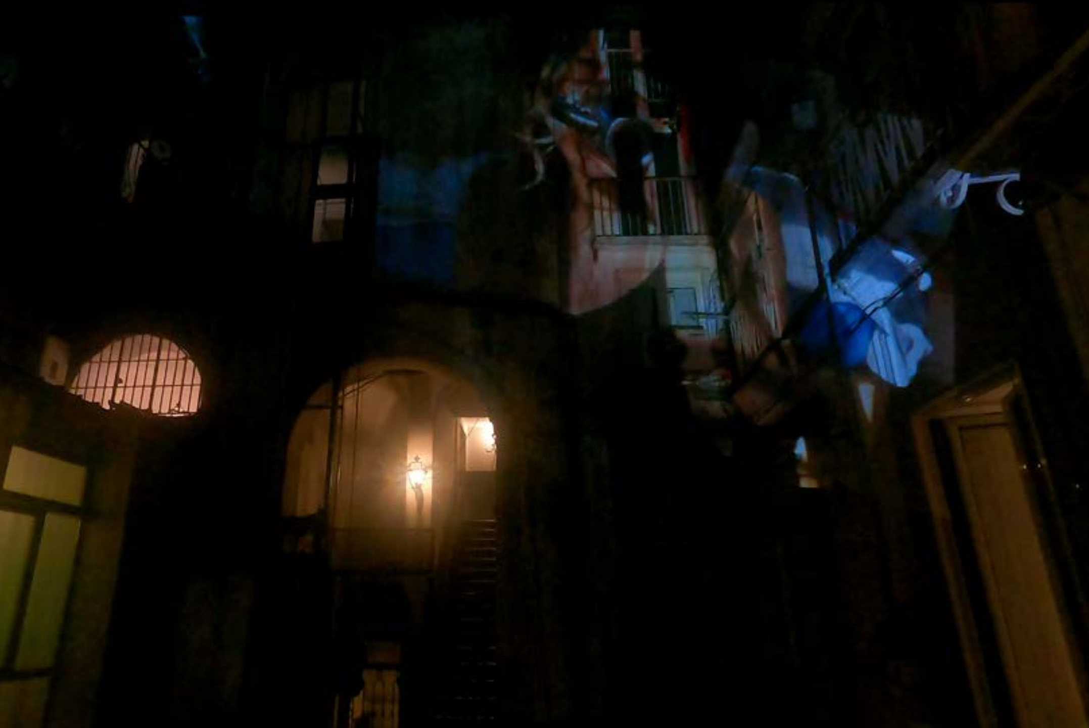
on the courtyard of a neighbourhood, naples