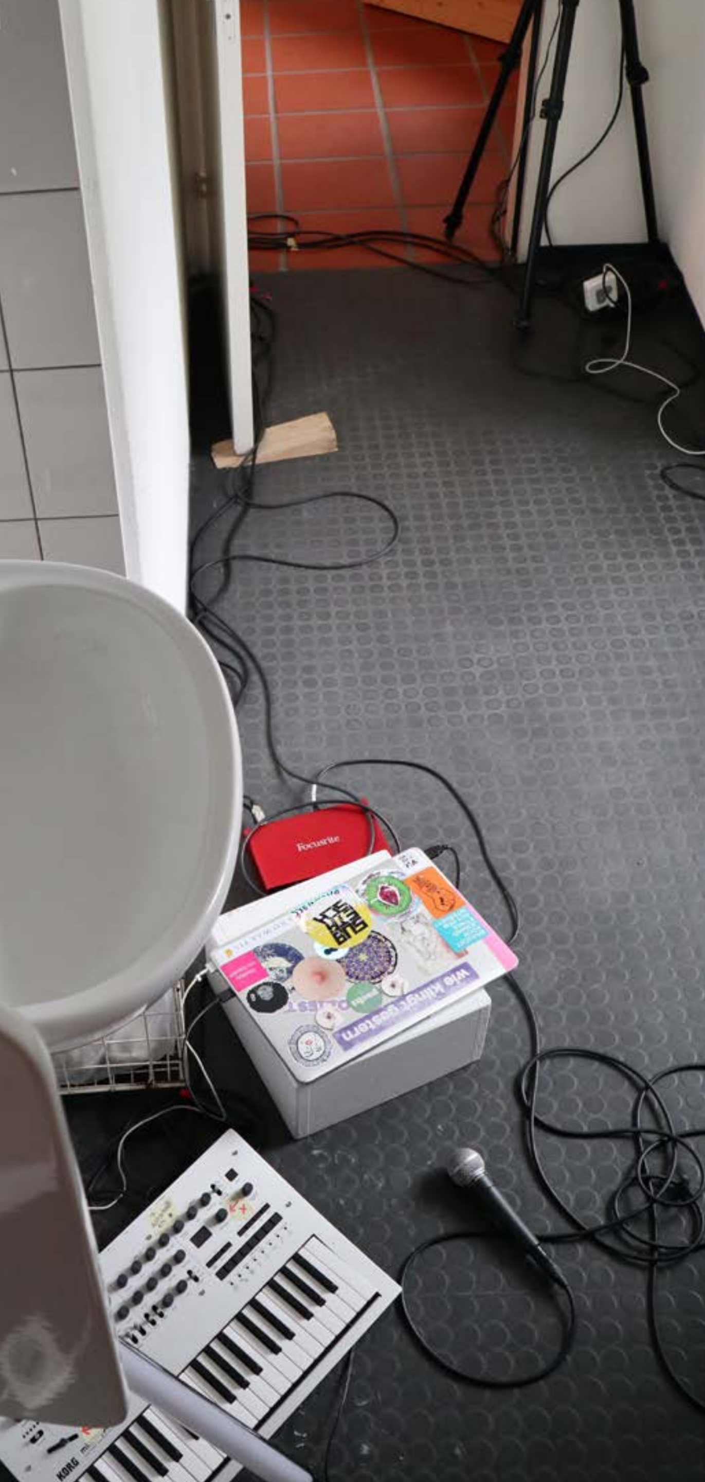
photos: insights taken before and during the performance photos following two pages: : two of various compositions of the videos during the performance