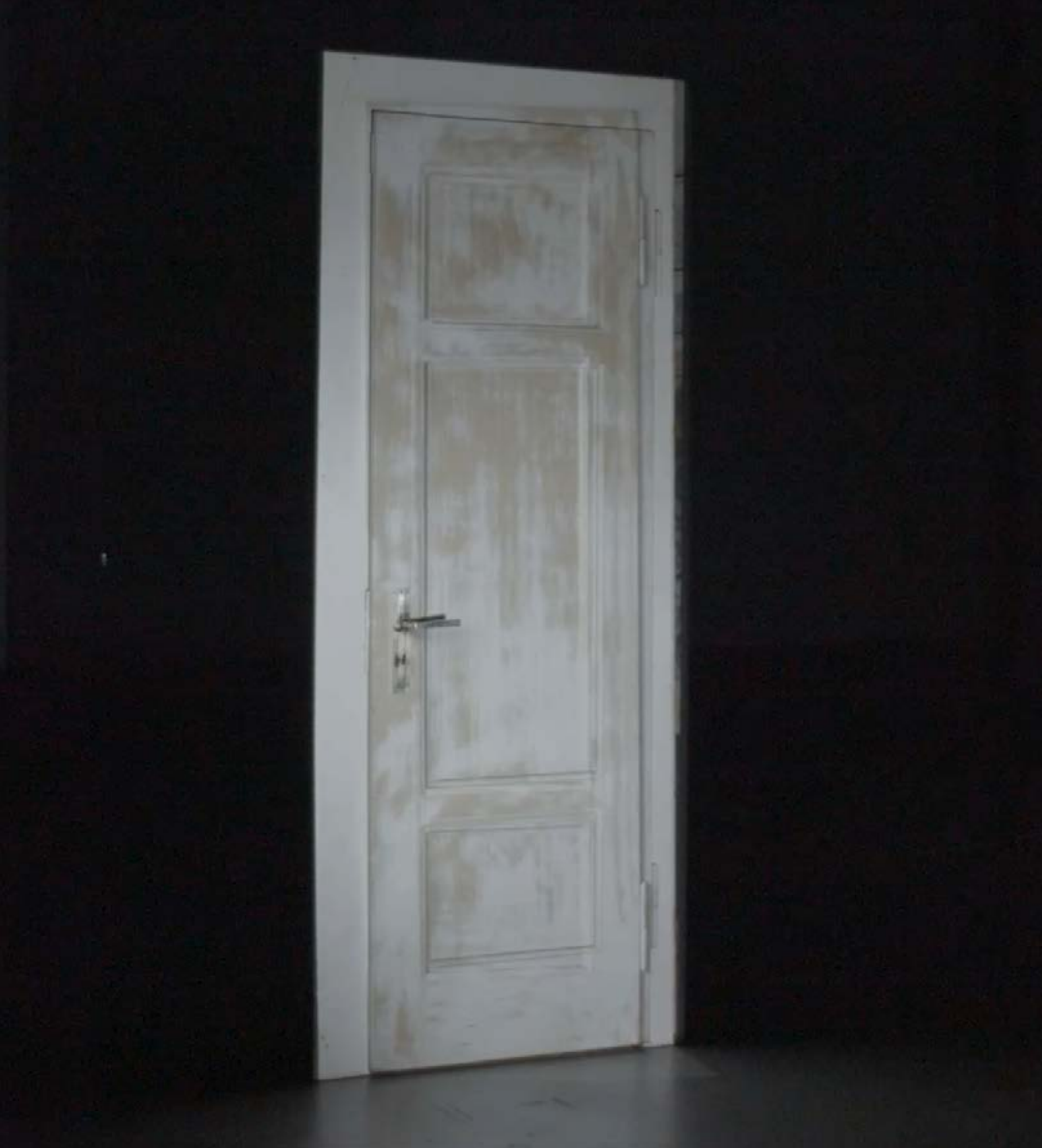
photo: at show during the music days following: stills of the mapping