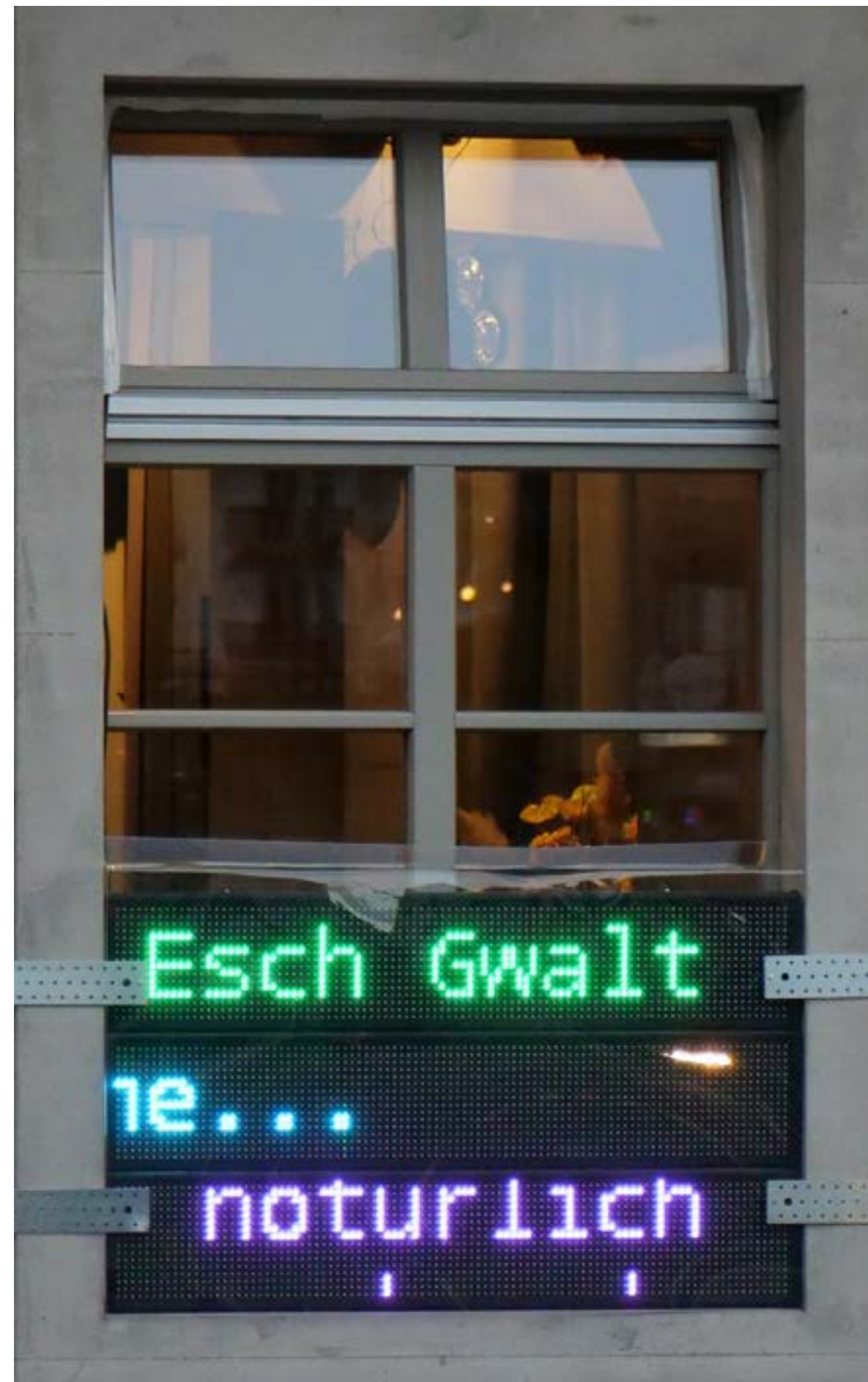
Installation at «tramhüsli», emmenbrücke, gerliswilstrasse photo last page: showcases at gerliswilstrasse