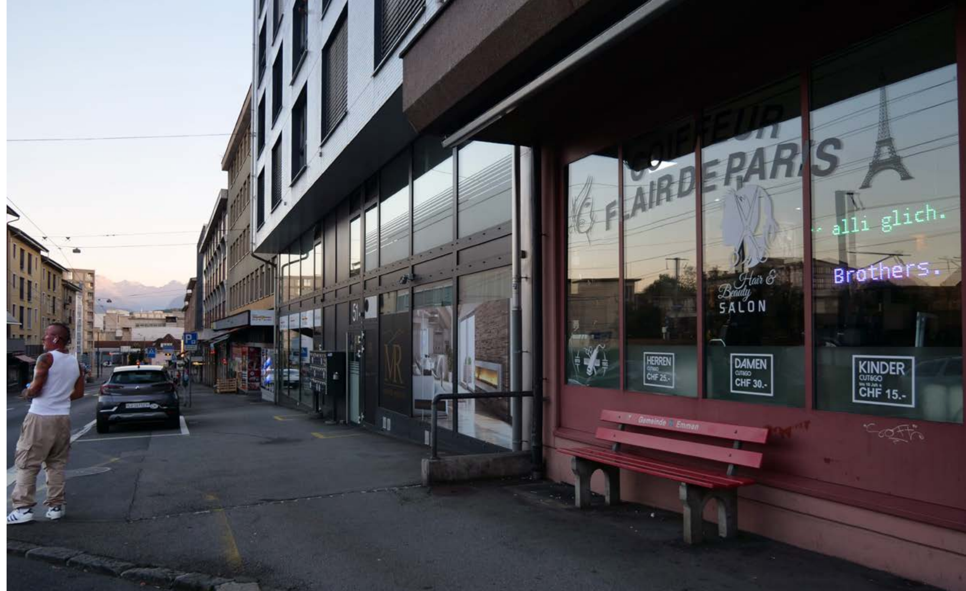
photo: installation at «coiffeur de paris», emmenbrücke gerliswilstrasse, next page: nylon, gerliswilstrasse