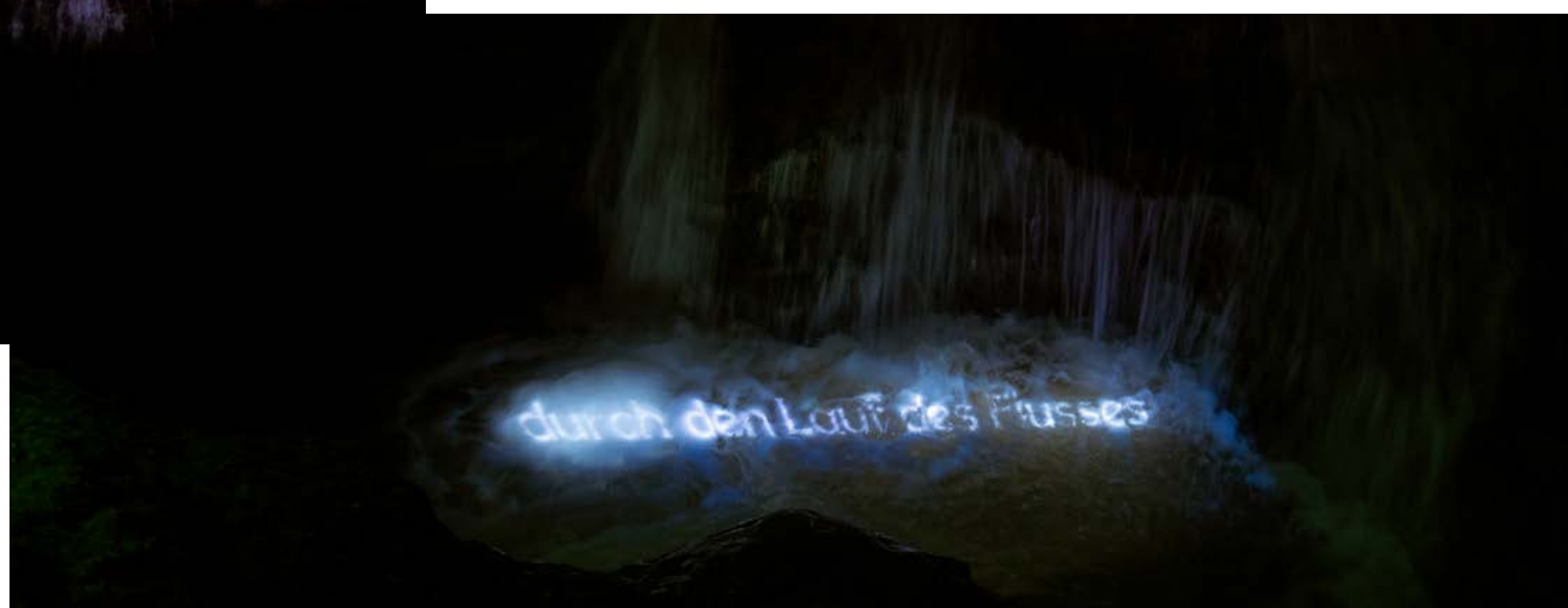
during the festival susurru